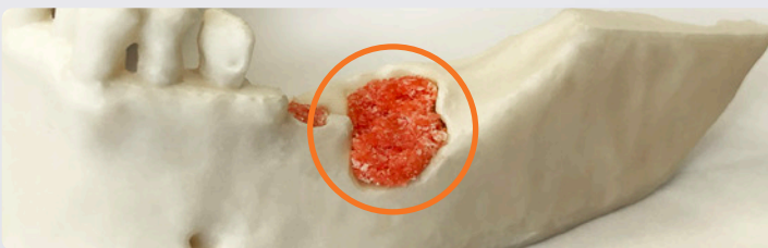
Once hydrated, it becomes moldable and can take the shape of a variety of defect shapes and sizes