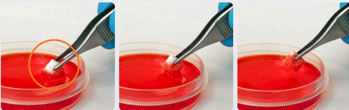
Hydrates almost immediately when introduced to the patient's blood or sterile saline