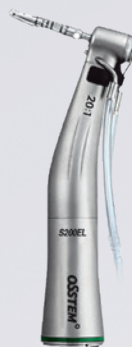
Deceleration Ratio of 20:1