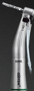
Deceleration Ratio of 20:1